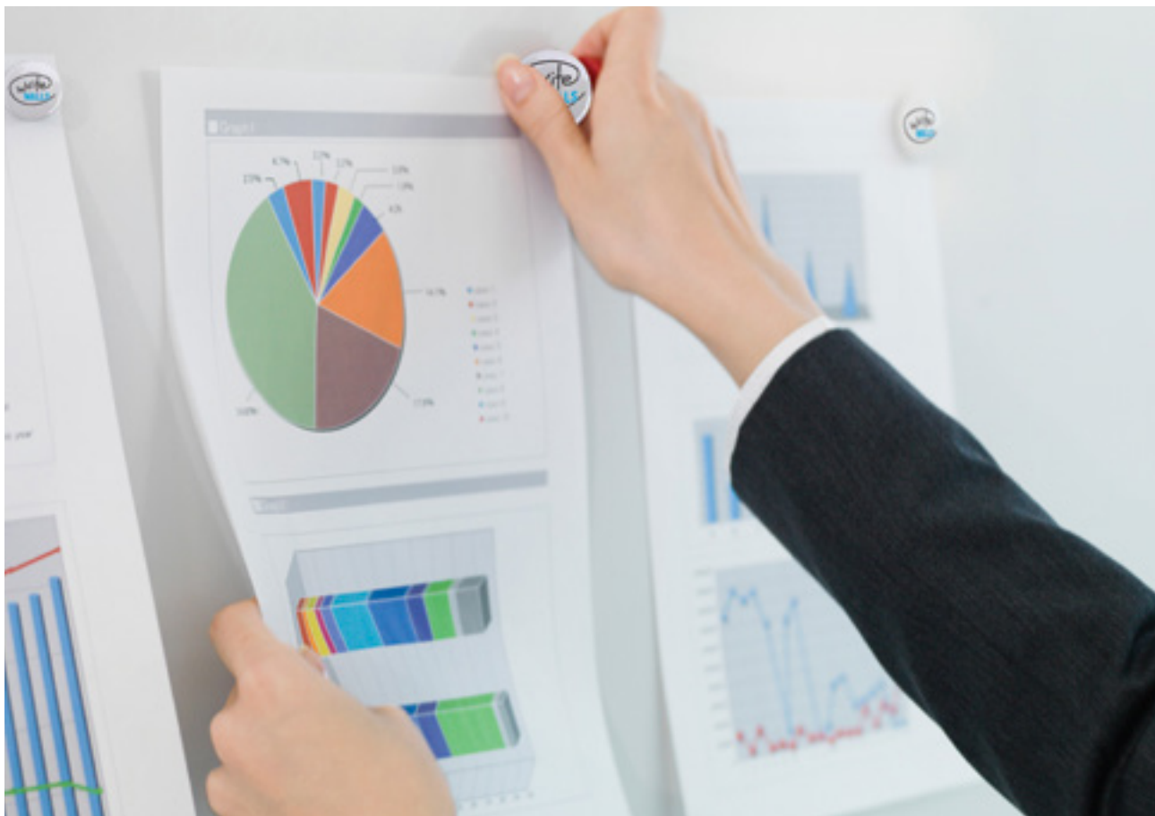
WriteMAGNETIC · WWMAG-WHITE