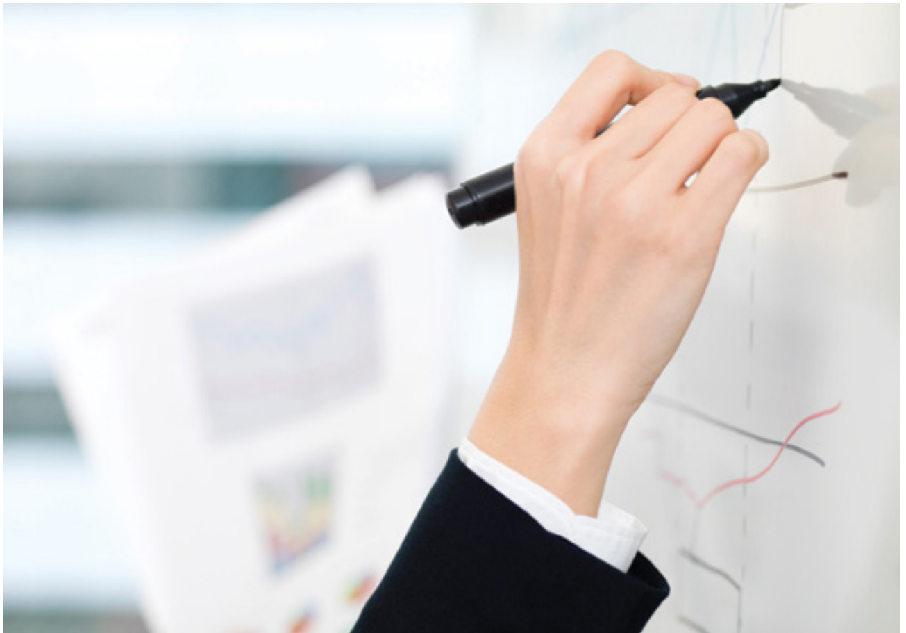
WriteNOW White · WWWD-WHITE