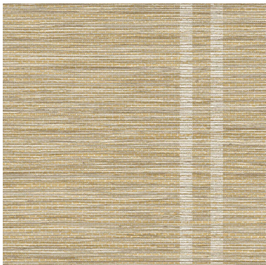
Click for Y48120HG