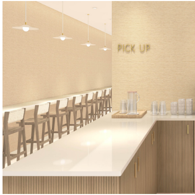
Click for Hampton Grass

Weight: Type II 20 oz | Width: 52" | Backing: Osnaburg | Match: Random Reversible | Repeat V 52" / H 18" | Fire Rating: Class A Passes Class A NFPA 101 Life Safety Code | Passes NFPA 286 Corner Burn Test | 5 Year Warranty | Low VOC | 10% Recycled