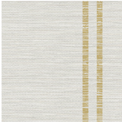
Click for Y48118HG

» CLICK FOR: » QUOTES » STOCK CHECK » SOURCEBOOK