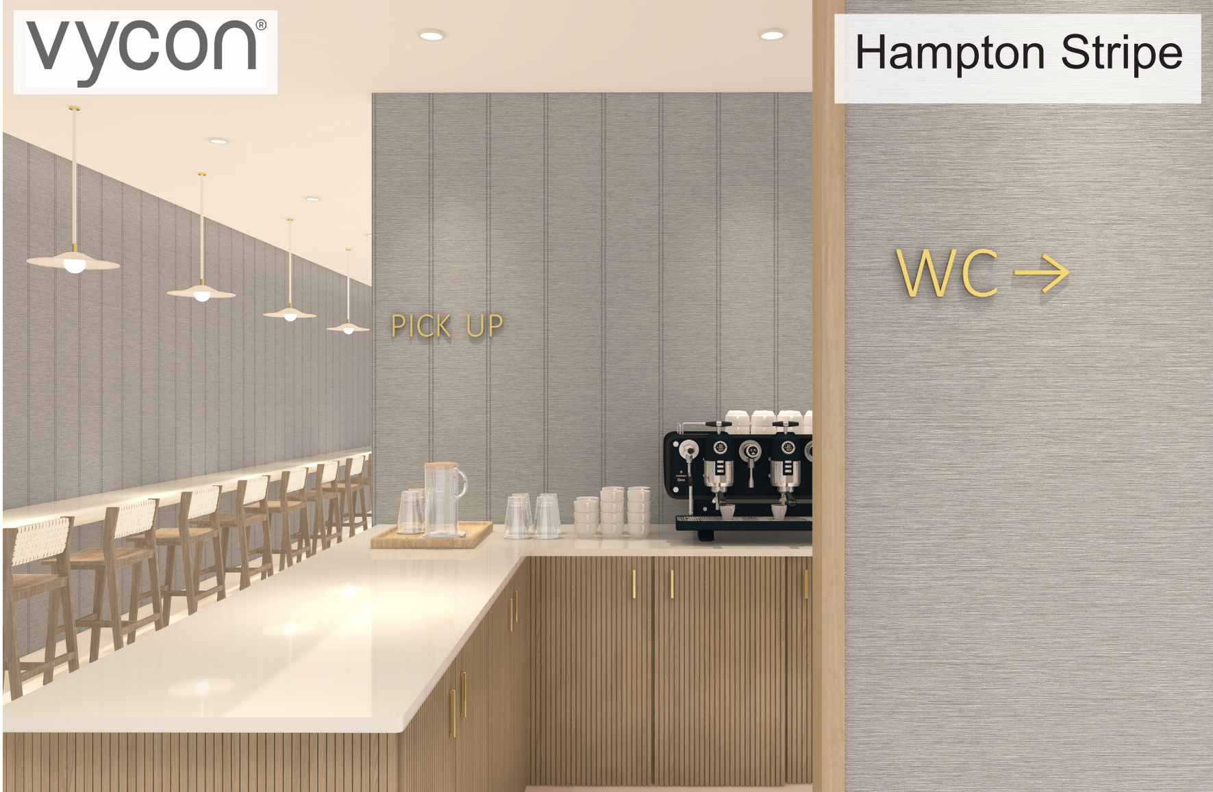
Made in the U.S.A.