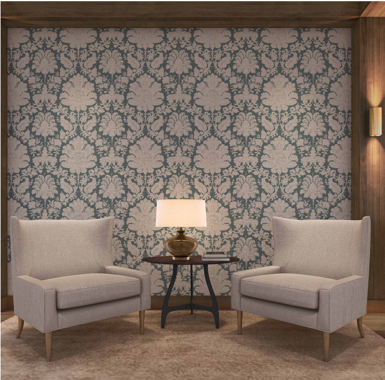
Click for more patterns by Vycon