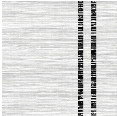
Click for Y48115HS