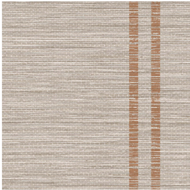
Click for Y48119HG