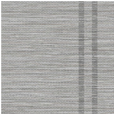
Click for Y48116HG