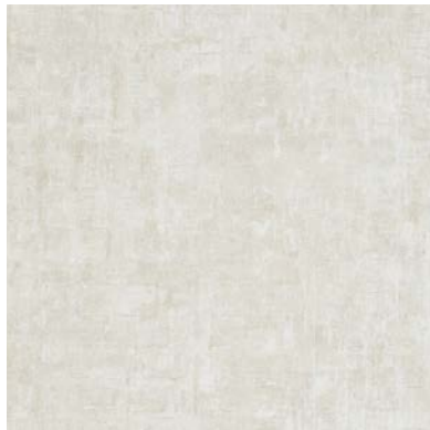
Click for DN2-BRI-01