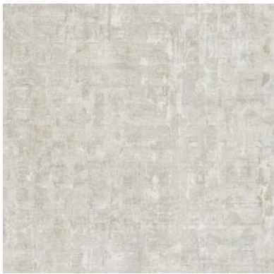
Click for DN2-BRI-11