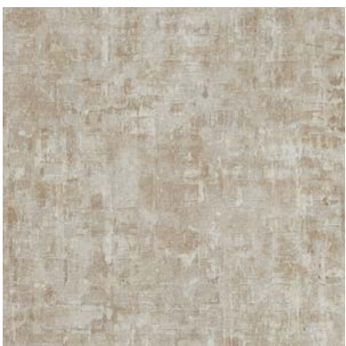
Click for DN2-BRI-05