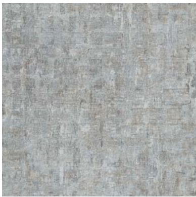
Click for DN2-BRI-15