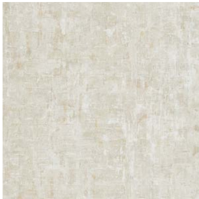
Click for DN2-BRI-02