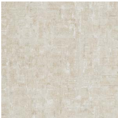
Click for DN2-BRI-03