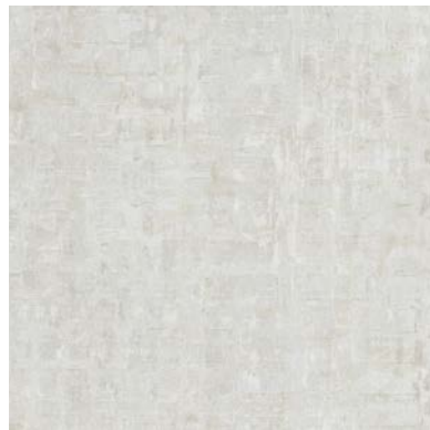
Click for DN2-BRI-10