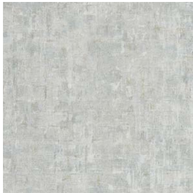
Click for DN2-BRI-12