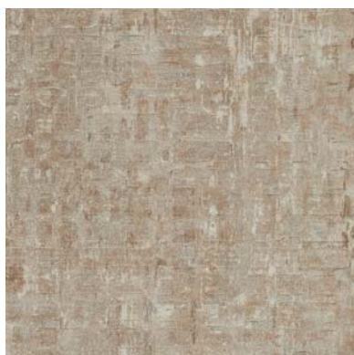
Click for DN2-BRI-06