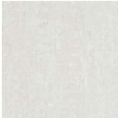
Click for DN2-BRI-08

Weight: Type II 20 oz | Width: 54” | Backing: Osaburg | Match: Random Reversible | Repeat V 24” x H 52” Fire Rating: Class A | Passes Class A NFPA 101 Life Safety Code | Passes NFPA 286 Corner Burn Test | Top Coat: Aqua Clear