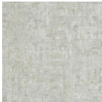
Click for DN2-BRI-14