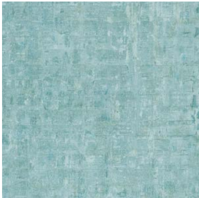
Click for DN2-BRI-09