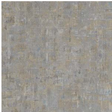
Click for DN2-BRI-16