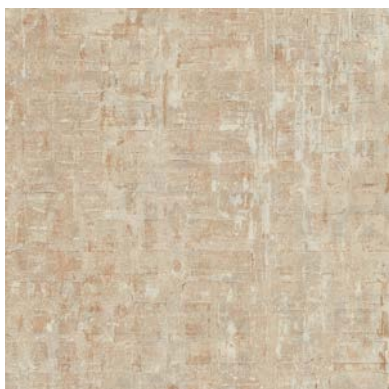
Click for DN2-BRI-04