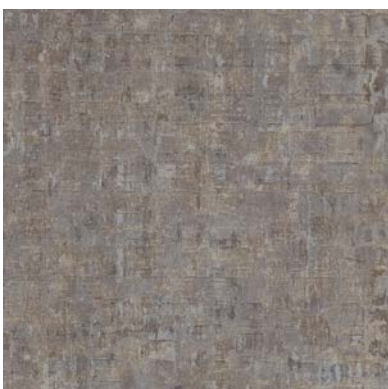
Click for DN2-BRI-07