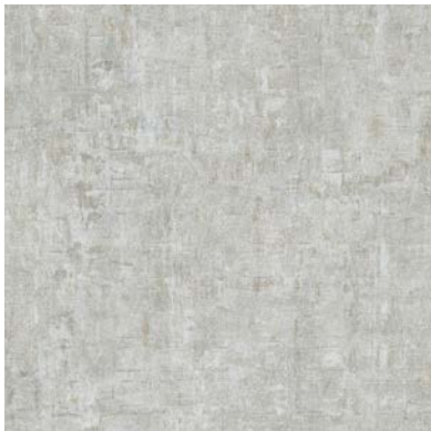
Click for DN2-BRI-13