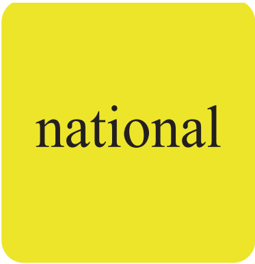
Click for all Solutions