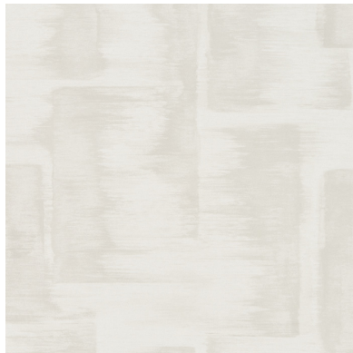
Click for CD2-BRO-01