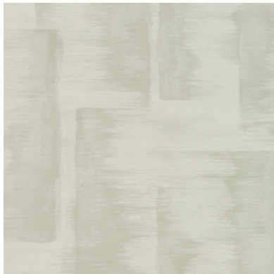
Click for CD2-BRO-02