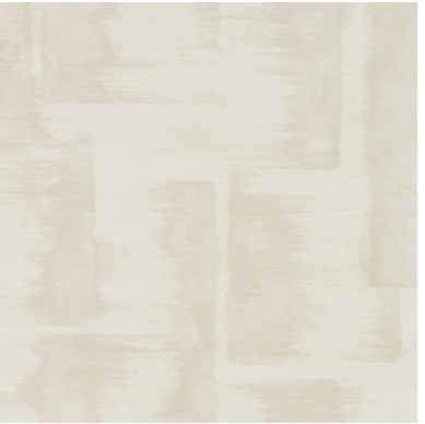
Click for CD2-BRO-11