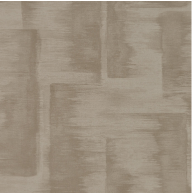
Click for CD2-BRO-13