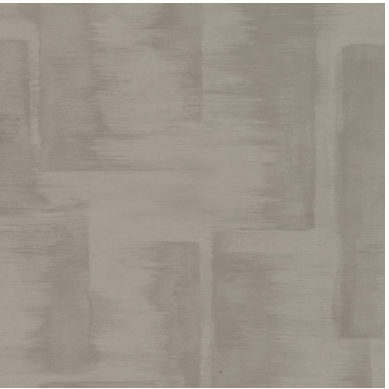
Click for CD2-BRO-05