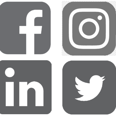
Click to be Social