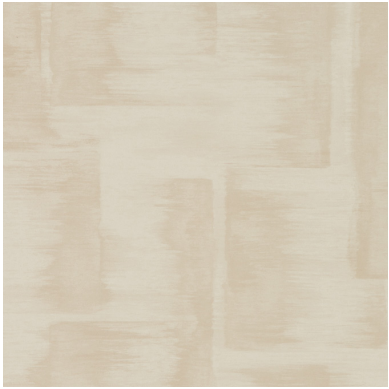
Click for CD2-BRO-12