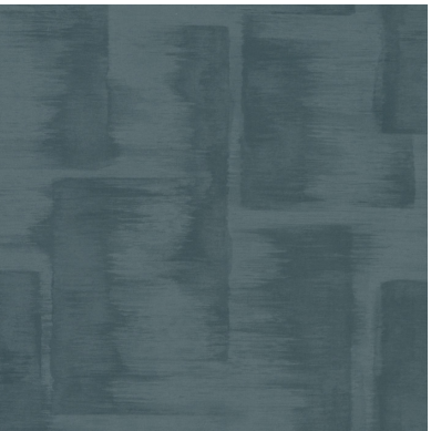
Click for CD2-BRO-06