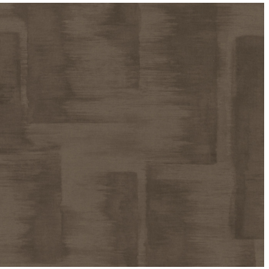
Click for CD2-BRO-15