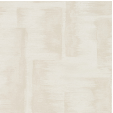
Click for CD2-BRO-10