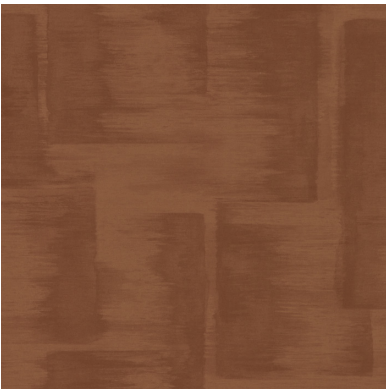
Click for CD2-BRO-14