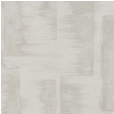
Click for CD2-BRO-03