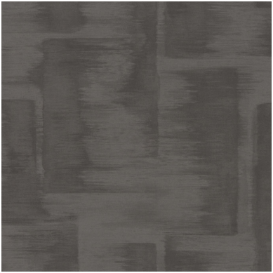
Click for CD2-BRO-16