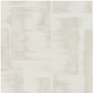
Click for CD2-BRO-08

Weight: Type II 20 oz | Width: 54” | Backing: Non-Woven | Match: Non-Reversible Straight Match | Repeat V 24” x H 52” | Warranty: 5 Year Fire Rating: Class A | Passes Class A NFPA 101 Life Safety Code | Passes NFPA 286 Corner Burn Test | Custom Colors & Weight Available