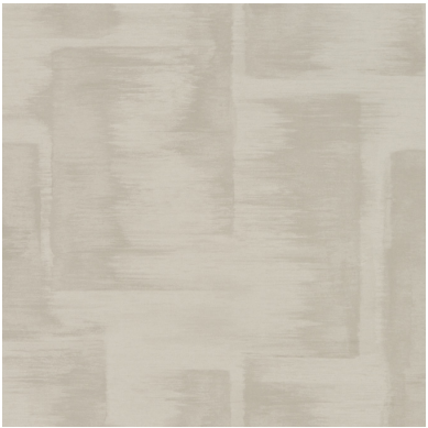
Click for CD2-BRO-04