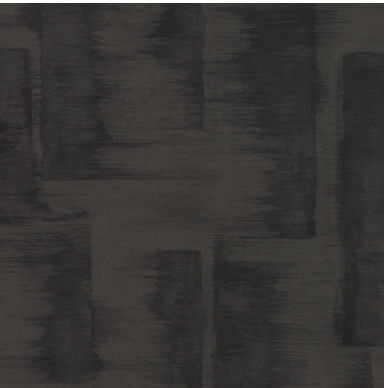
Click for CD2-BRO-09