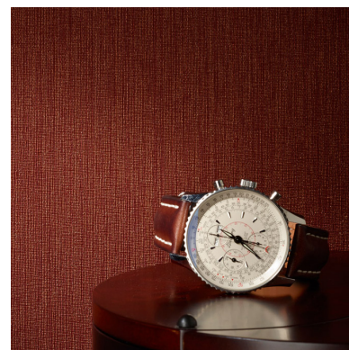
Click for Entire Canyon Collection

Weight: Type II 20 oz | Width: 54" | Backing: Non-Woven | Match: Random Match Reversible | Repeat V 18"/H 53" | Fire Rating: Class A | Passes Class A NFPA 101 Life Safety Code | Passes NFPA 286 Corner Burn Test