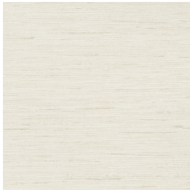
Click for CD2-ENO-01