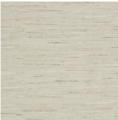
Click for CD2-ENO-04

» CLICK FOR: » QUOTES » STOCK CHECK » SOURCEBOOK