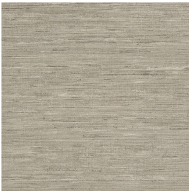
Click for CD2-ENO-05