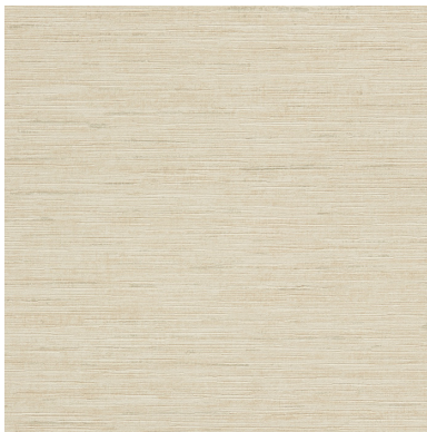
Click for CD2-ENO-10