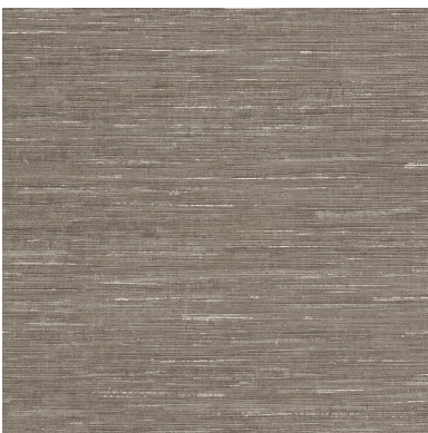
Click for CD2-ENO-06