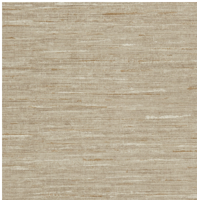
Click for CD2-ENO-13