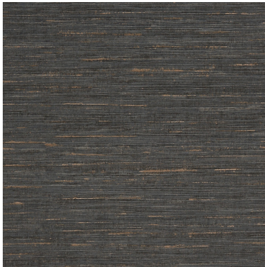
Click for CD2-ENO-09