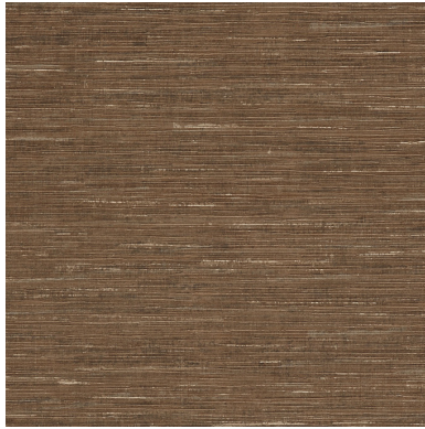
Click for CD2-ENO-16