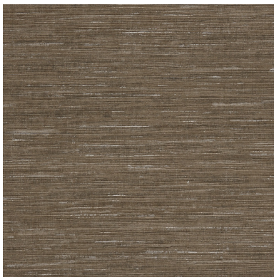
Click for CD2-ENO-14