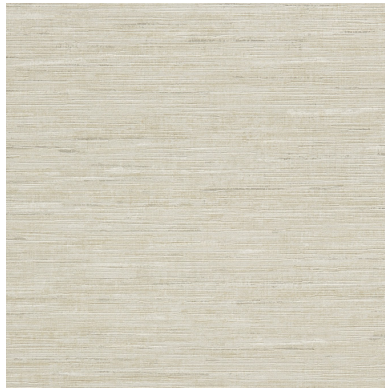
Click for CD2-ENO-08

| Weight: Type II 20 oz | Width: 54” | Backing: Osnaburg | Match: Random Reversible | Repeat V 24” x H 53” | Top Coat: Aqua Clear | | Fire Rating: Class A | Passes Class A NFPA 101 Life Safety Code | Passes NFPA 286 Corner Burn Test |