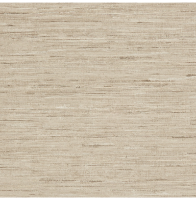
Click for CD2-ENO-11