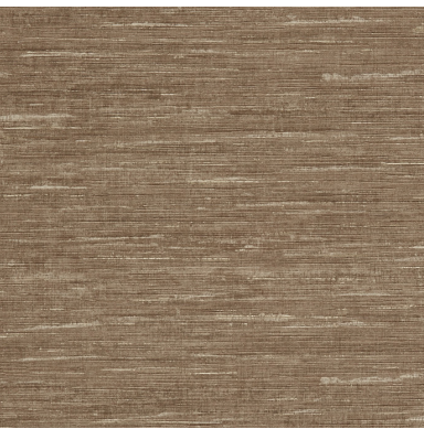
Click for CD2-ENO-15