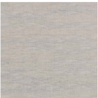
Click for CD2-GHO-04