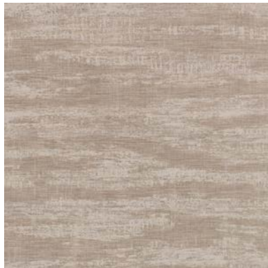
Click for CD2-GHO-12