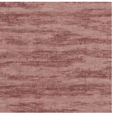
Click for CD2-GHO-15