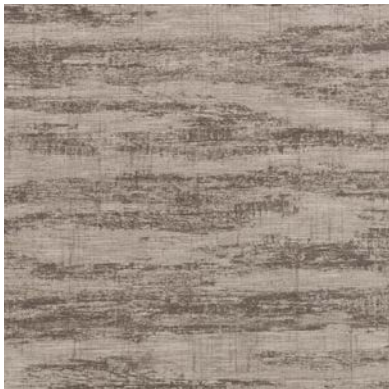
Click for CD2-GHO-13