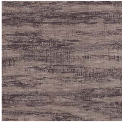
Click for CD2-GHO-16