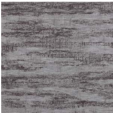
Click for CD2-GHO-09