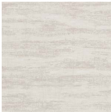
Click for CD2-GHO-08

Weight: Type II 20 oz | Width: 54” | Backing: Non-Woven | Match: Reversible Straight Across | Repeat V 36” x H 54” | Top Coat: Aqua Clear | Fire Rating: Class A | Passes Class A NFPA 101 Life Safety Code | Passes NFPA 286 Corner Burn Test |