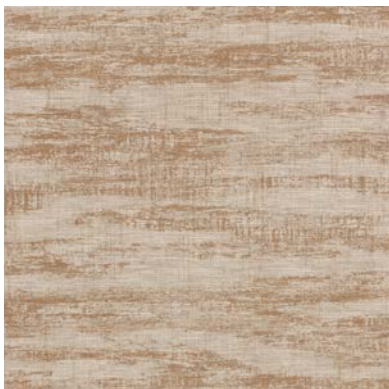
Click for CD2-GHO-14