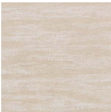
Click for CD2-GHO-10