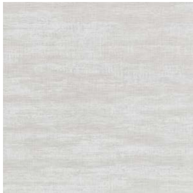
Click for CD2-GHO-01