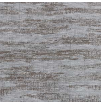
Click for CD2-GHO-07