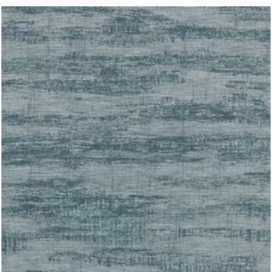
Click for CD2-GHO-06