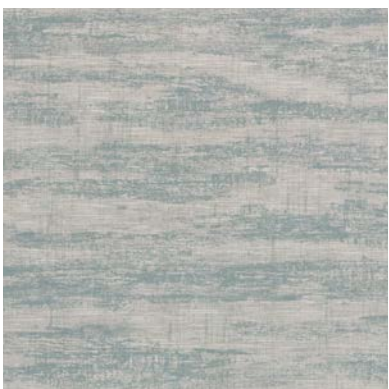
Click for CD2-GHO-05