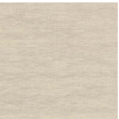
Click for CD2-GHO-11