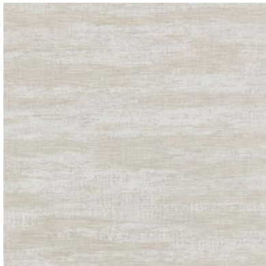
Click for CD2-GHO-02