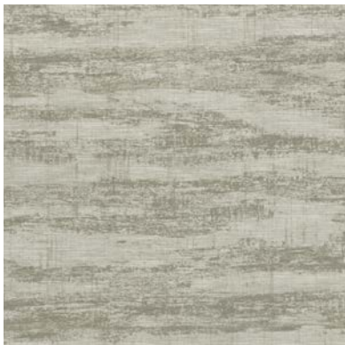
Click for CD2-GHO-03