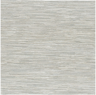
Click for DN2-KRA-09