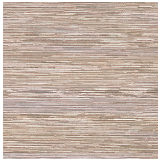
Click for DN2-KRA-13