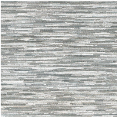
Click for DN2-KRA-02