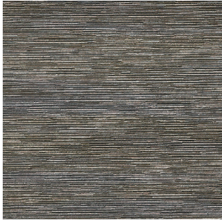
Click for DN2-KRA-10