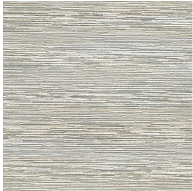
Click for DN2-KRA-01