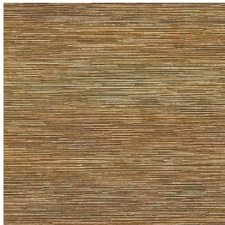
Click for DN2-KRA-15