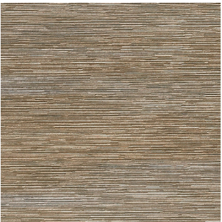
Click for DN2-KRA-16