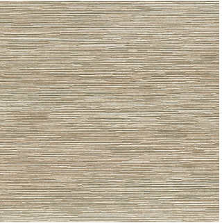
Click for DN2-KRA-12