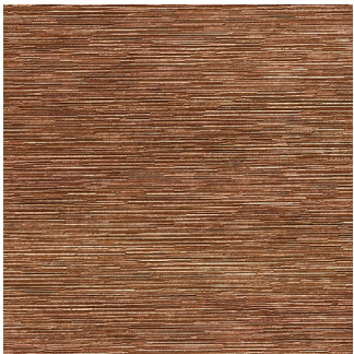
Click for DN2-KRA-14