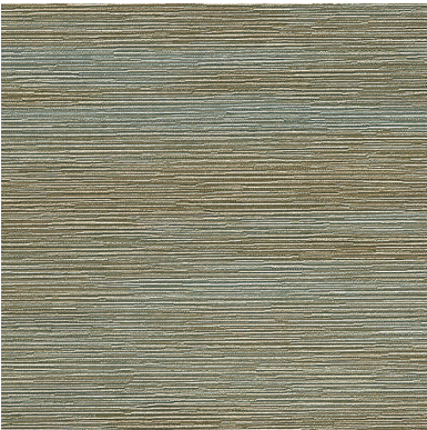
Click for DN2-KRA-06