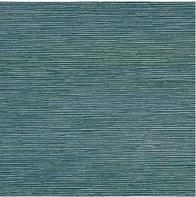
Click for DN2-KRA-07