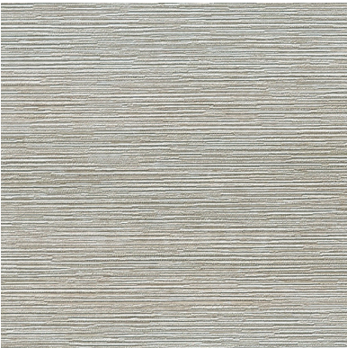
Click for DN2-KRA-03