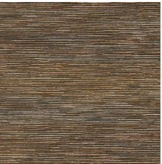
Click for DN2-KRA-17