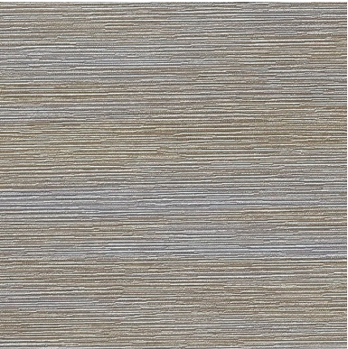
Click for DN2-KRA-05