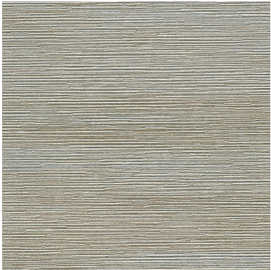
Click for DN2-KRA-04