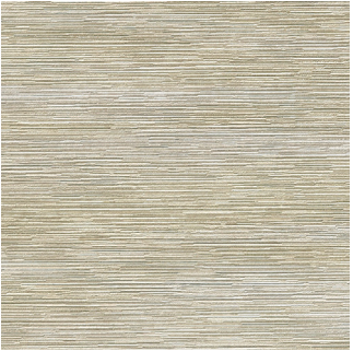
Click for DN2-KRA-11