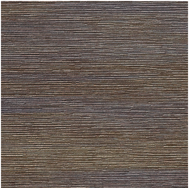
Click for DN2-KRA-18