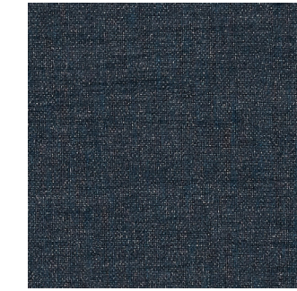
Click for DN2-MTU-10