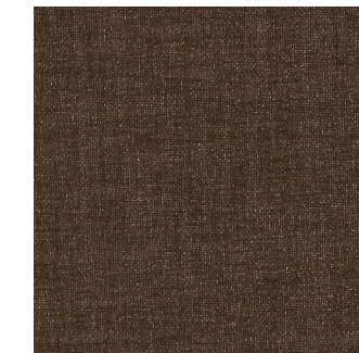
Click for DN2-MTU-20