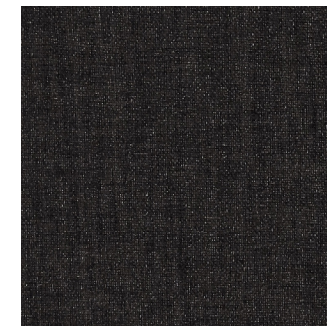
Click for DN2-MTU-12