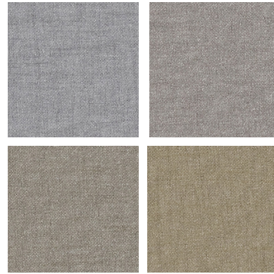
Click for DN2-MTU-02-05