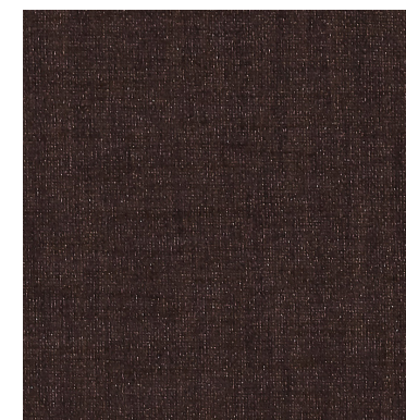
Click for DN2-MTU-22