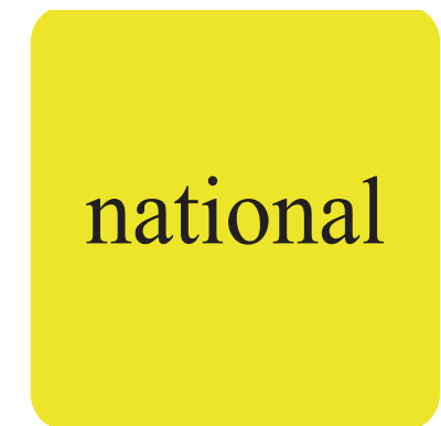
Click for all Solutions