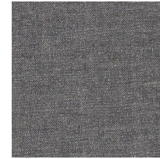
Click for DN2-MTU-08