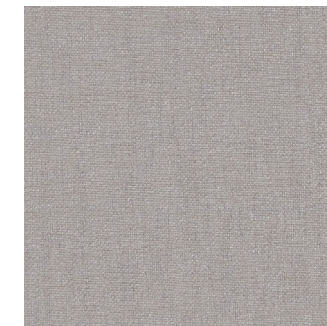
Click for DN2-MTU-13