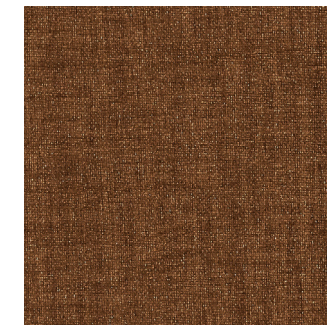
Click for DN2-MTU-18