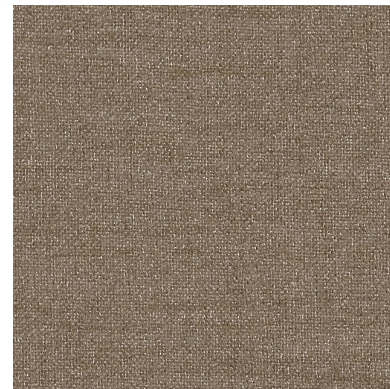
Click for DN2-MTU-06