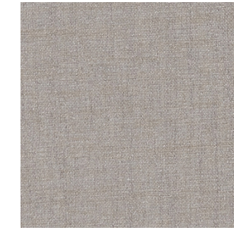
Click for DN2-MTU-11