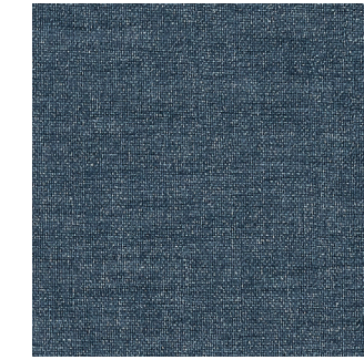
Click for DN2-MTU-09