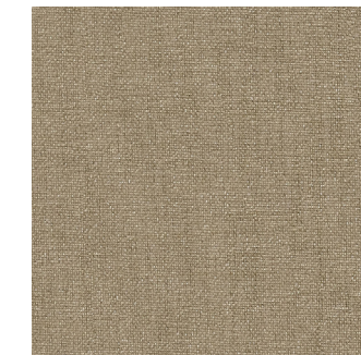
Click for DN2-MTU-16