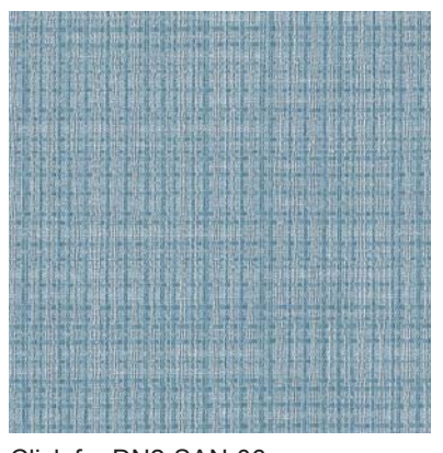
Click for DN2-SAN-06