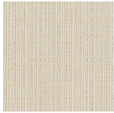
Click for DN2-SAN-13