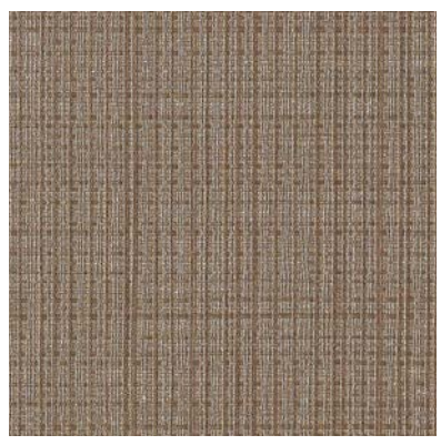
Click for DN2-SAN-15