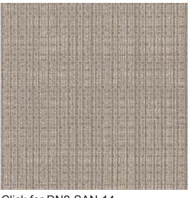
Click for DN2-SAN-14