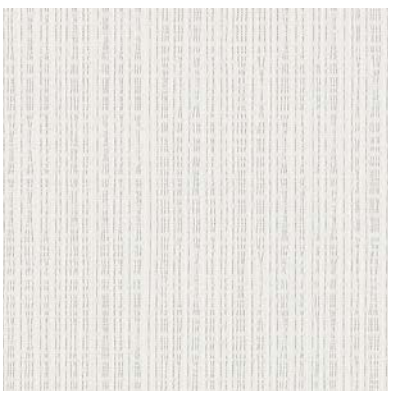
Click for DN2-SAN-11