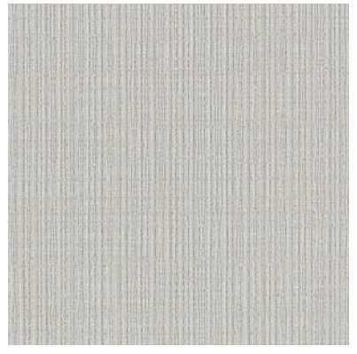
Click for DN2-SAN-05