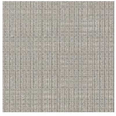
Click for DN2-SAN-07