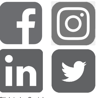
Click to be Social