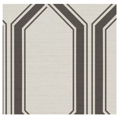
Click for DN2-STR-14