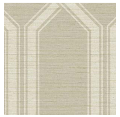
Click for DN2-STR-05

Weight: Type II 20 oz | Width: 54" | Backing: Non-Woven | Match: Straight Across Reversible | Repeat V 12" x H 6.5" | Fire Rating: Class A | Passes Class A NFPA 101 Life Safety Code | Passes NFPA 286 Corner Burn Test | Top Coat: Aqua Clear |