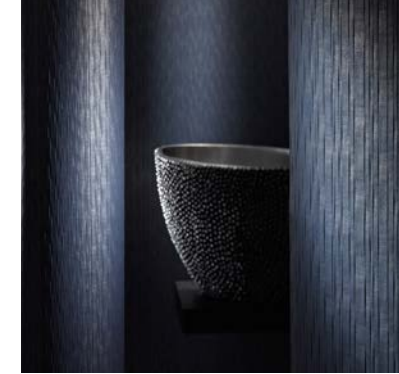
Click for Denovo Pairing