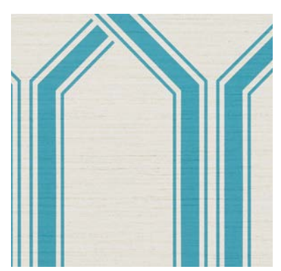
Click for DN2-STR-13