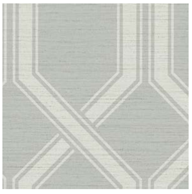
Click for DN2-STR-06