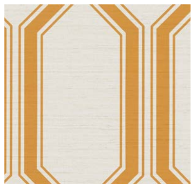
Click for DN2-STR-10