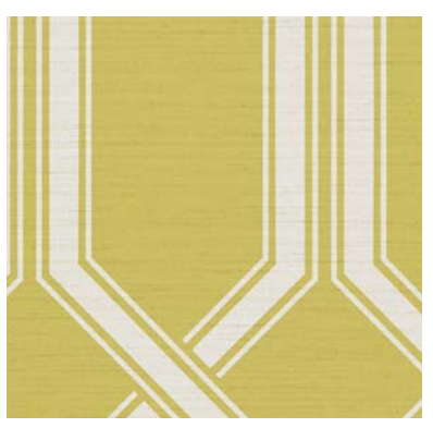
Click for DN2-STR-11