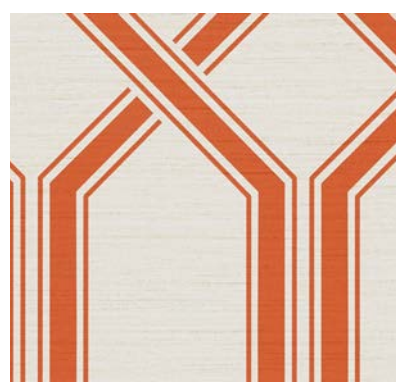
Click for DN2-STR-09