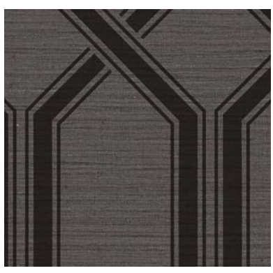
Click for DN2-STR-15