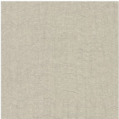
Click for DN2-VNO-27