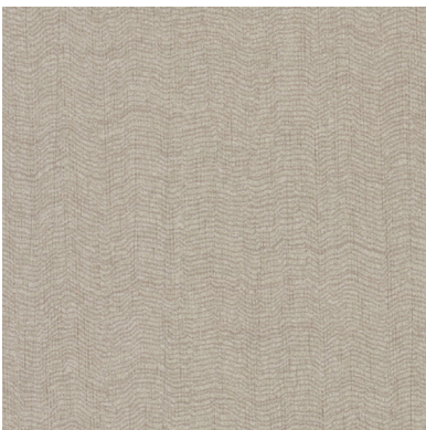
Click for DN2-VNO-05