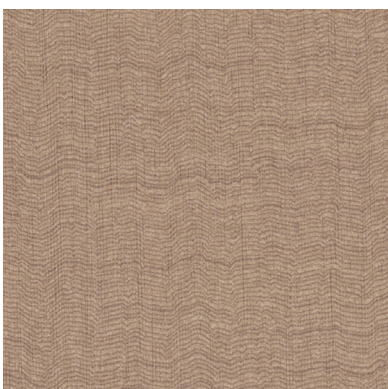
Click for DN2-VNO-22