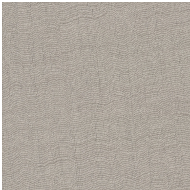
Click for DN2-VNO-28