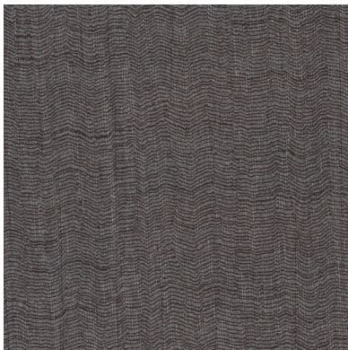
Click for DN2-VNO-26