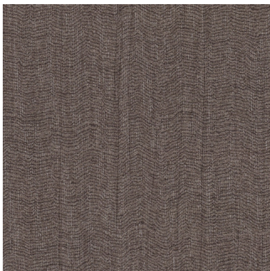
Click for DN2-VNO-24