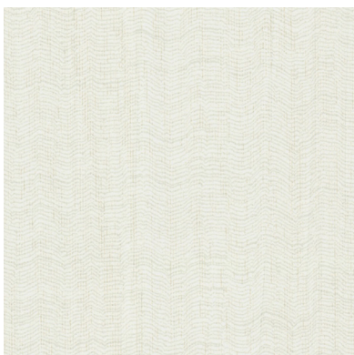
Click for DN2-VNO-25