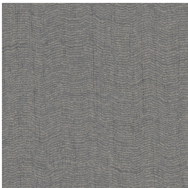
Click for DN2-VNO-29