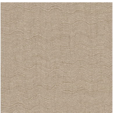
Click for DN2-VNO-08