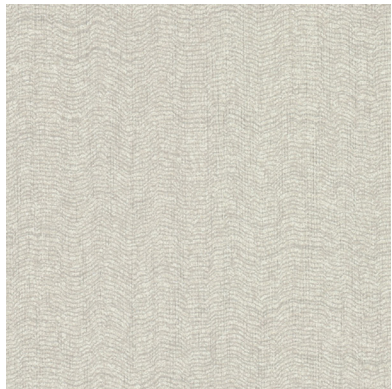
Click for DN2-VNO-04