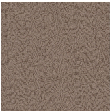
Click for DN2-VNO-23