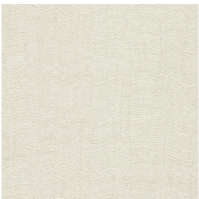
Click for DN2-VNO-20