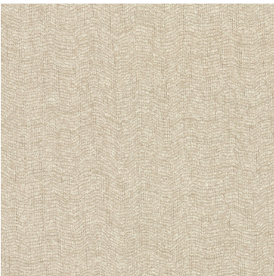
Click for DN2-VNO-07