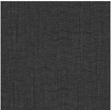
Click for DN2-VNO-31