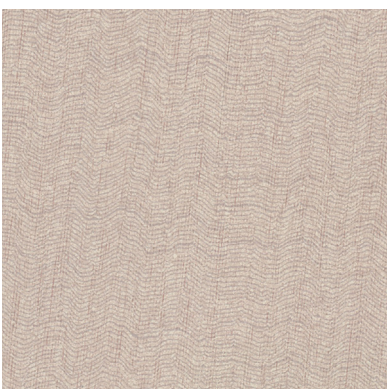
Click for DN2-VNO-21