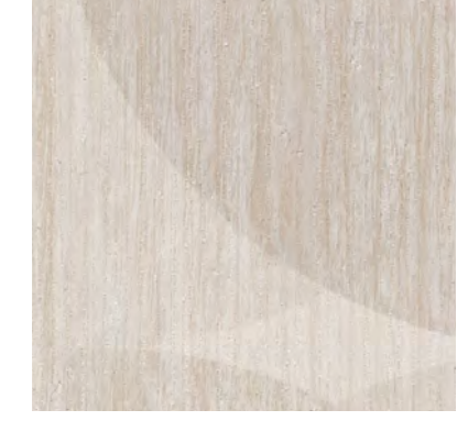
Click for CM148-2805