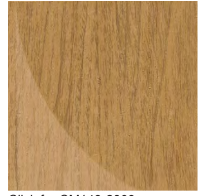
Click for CM148-2809