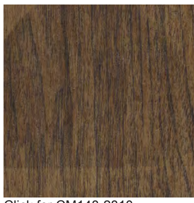
Click for CM148-2810