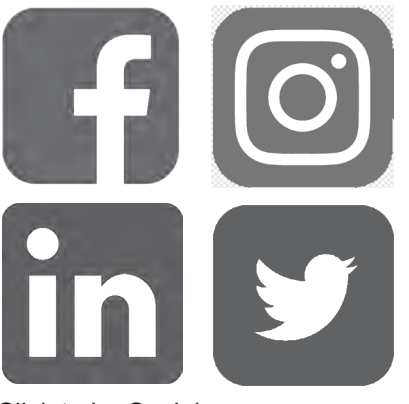
Click to be Social