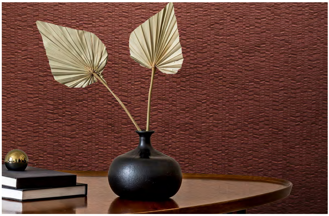
Click for more patterns by Command

Weight: Type II 20 oz | Width: 52/54" | Backing: Non-Woven | Match: 18" Straight Match | Reversible | CE Declaration of Conformity Fire Rating: Class A | Passes Class A NFPA 101 Life Safety Code | Passes NFPA 286 Corner Burn Test | Anti-microbial Top Coat Available