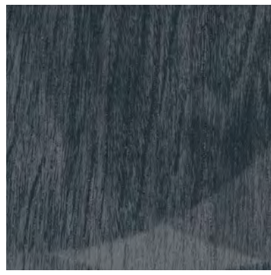
Click for CM147-2803